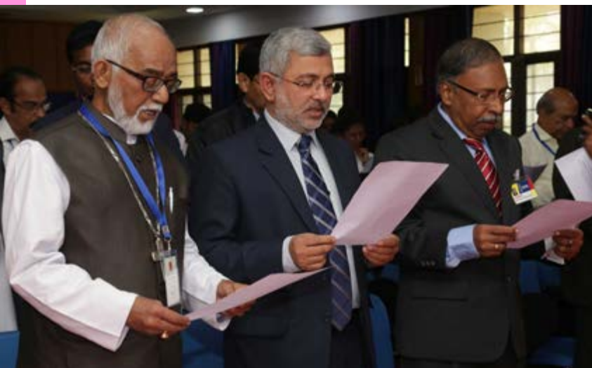
Dignitaries and participants reciting the Preamble of the Constitution

The 25th National Convention of Christian Journalists by ICPA also became a platform to honour some of the most phenomenal journalists and their works.