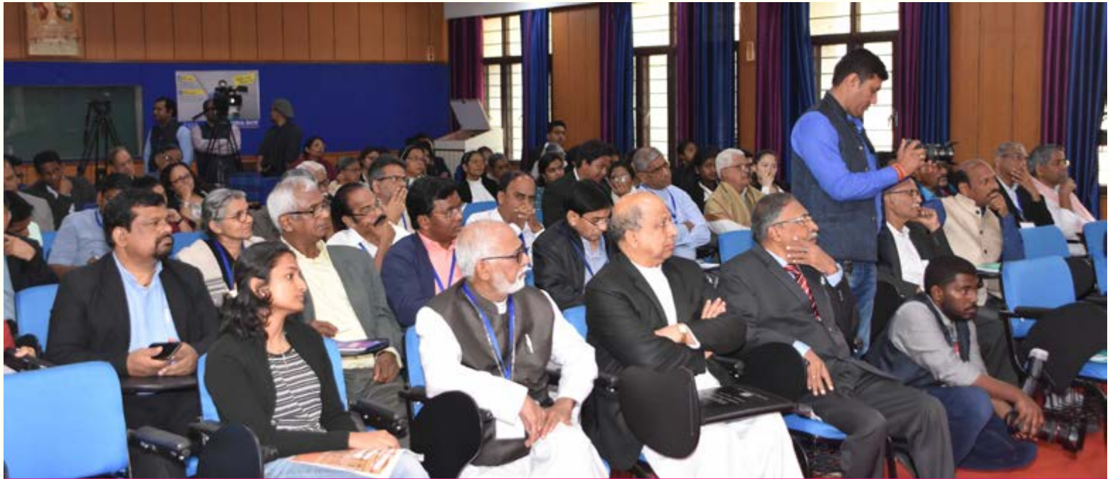
Dignitaries and participants at the 25th National Convention of Christian Journalists in Delhi