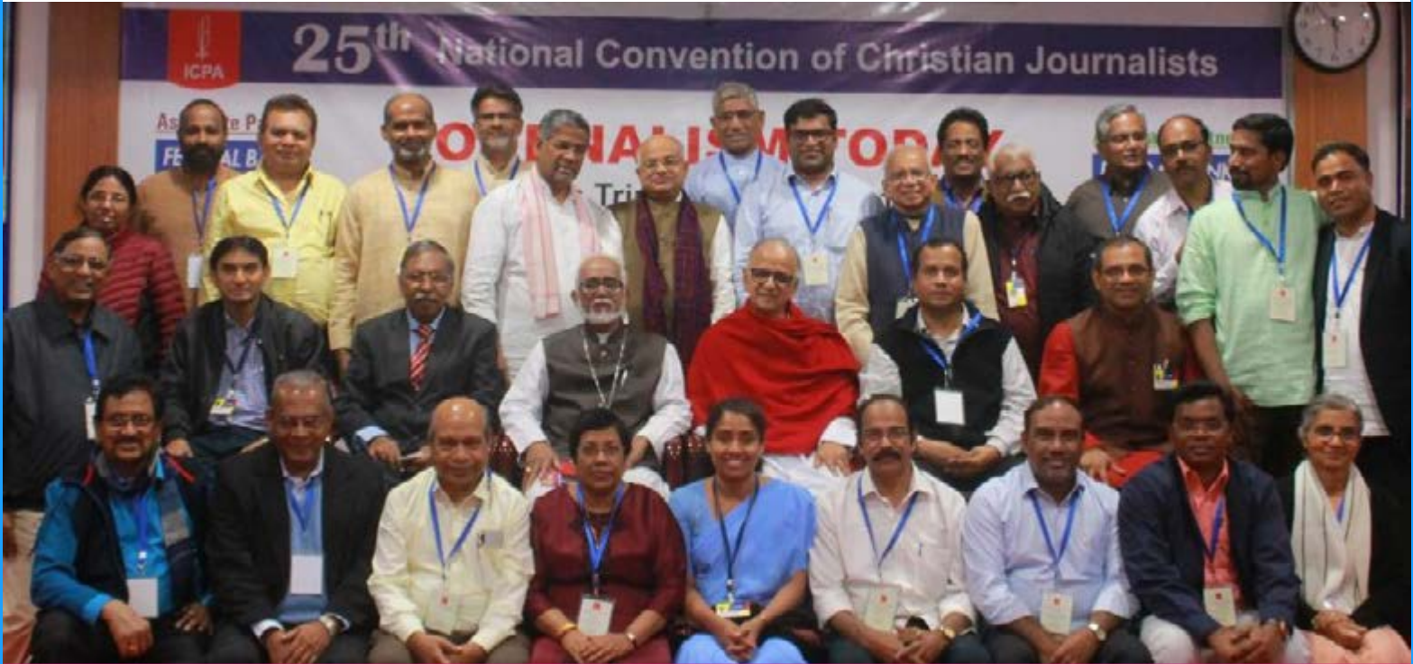
ICPA Members at the National Convention and AGBM in Delhi

W e, members of the Indian Catholic Press Association (ICPA) met at the Don Bosco Provincial House, Okhla, New Delhi on Feb. 29, 2020 for our Annual General Body Meeting . This was preceded by the 25 th National Convention of Christian Journalists , which was organized under the aegis of the ICPA. The convention, since the last twenty-five years, has served as a meeting ground for journalists to discuss the context, events and trends that affect contemporary journalism. Our theme this year was ‘Journalism Today: Pragmatism Triumphs over Principles?’