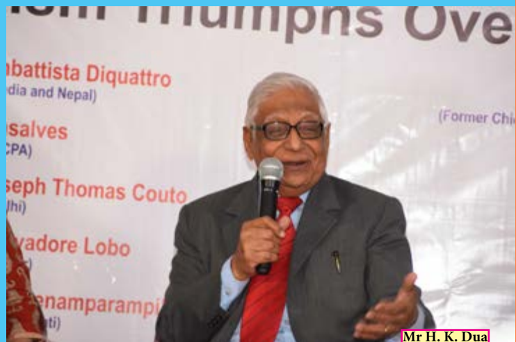
Mr H. K. Dua