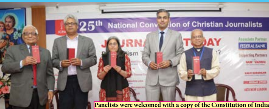
Panelists were welcomed with a copy of the Constitution of India