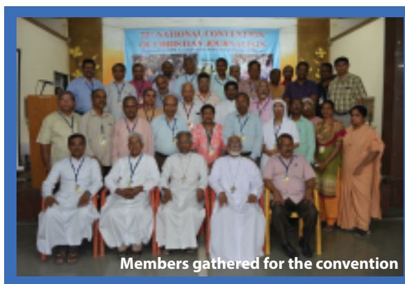
Members gathered for the convention

The traditional lamp was lit by the dignitaries - in a gesture that dispels the