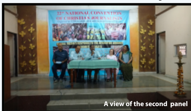
A view of the second panel