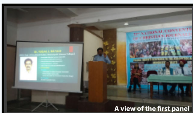
A view of the first panel

Centre Nagpur moderated the session. He concluded saying if peace is to be brought about in